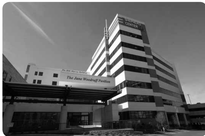
Left: Shepherd Center in 1975. Right: Shepherd Center today.