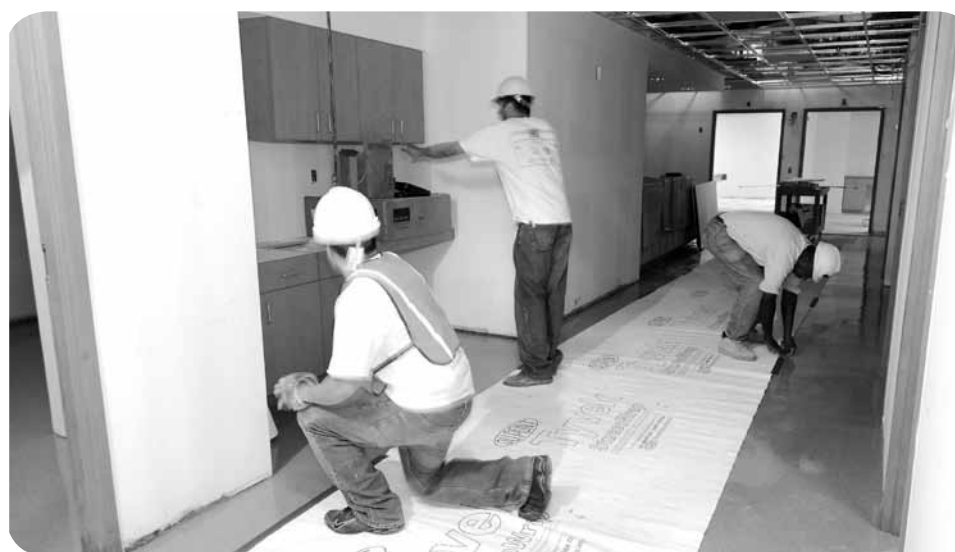
Above: Work crews prepare the fifth floor construction of the Marcus-Woodruff Building.

Patient and family requests for more private rooms were a major factor in the build-out of the SCI unit.