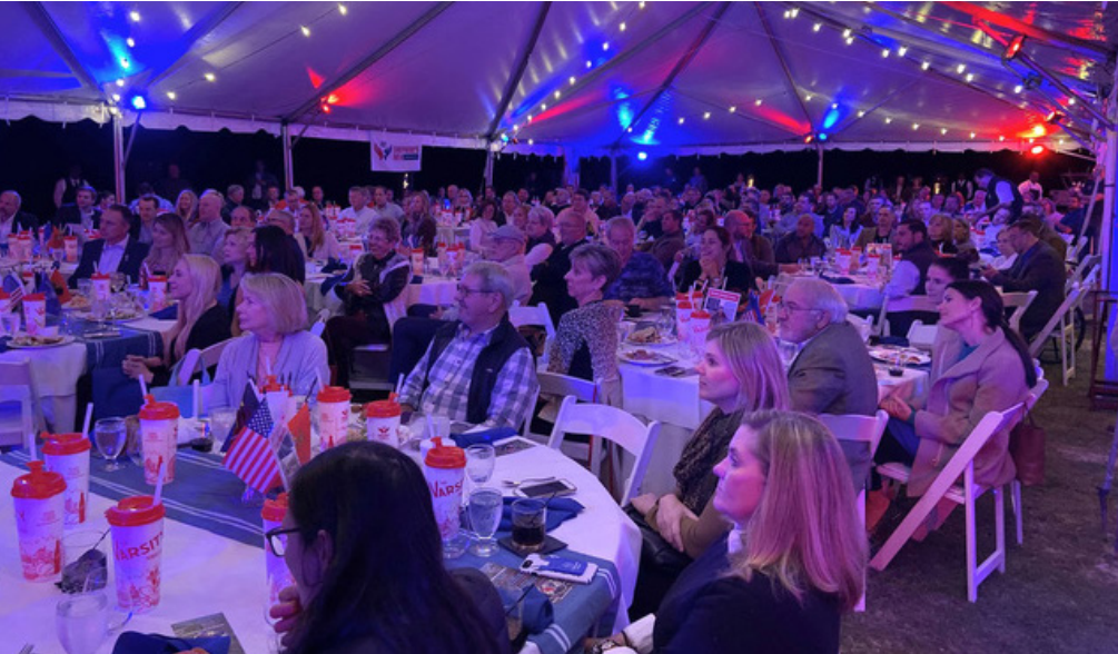
Support from sponsors and participants at the Shepherd's Men Dinner, Bourbon & Wine Tasting and Auction raised more than $220,000 for Shepherd Center's SHARE Military Initiative.