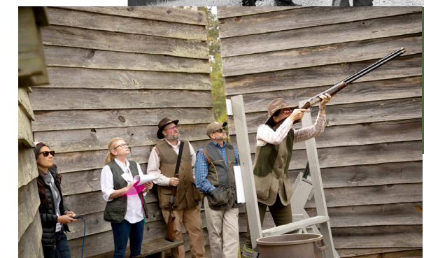
The Annie Oakley Shooters hosted their 16th clay shoot tournament on November 8, 2019 to benefit the SHARE Military Initiative.