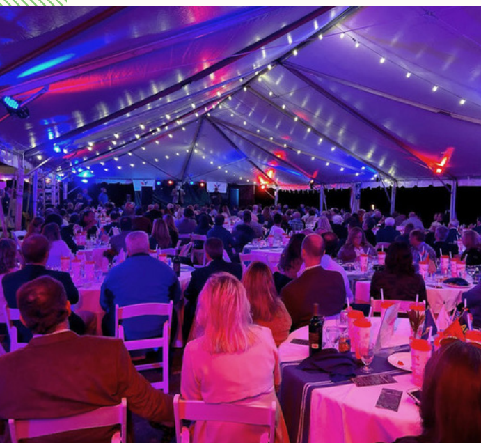
Shepherd's Men hosted their third annual Dinner, Auction, Bourbon and Wine Tasting on October 24, 2019.