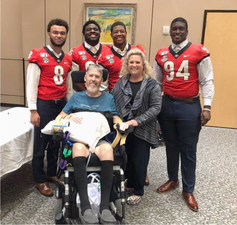
Patients and their families at Shepherd Center got a pre-game-day visit from Georgia Football players in November 2019.