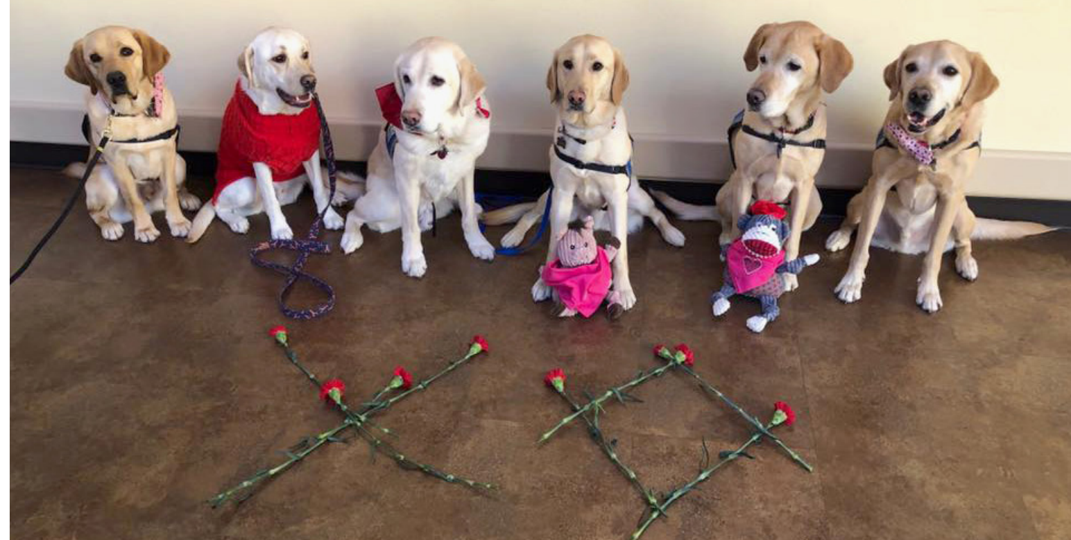
Shepherd Center's facility dogs spread the love throughout the Center by handing out flowers to patients and staff on Valentine's Day.