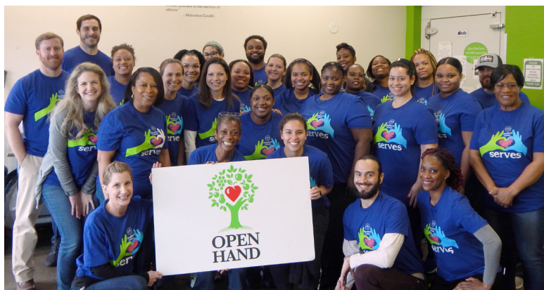
Shepherd Center employees have participated in two Shepherd Serves volunteer events so far this year including Open Hand Atlanta and FODAC.

We look forward to our next Shepherd Serves events. *