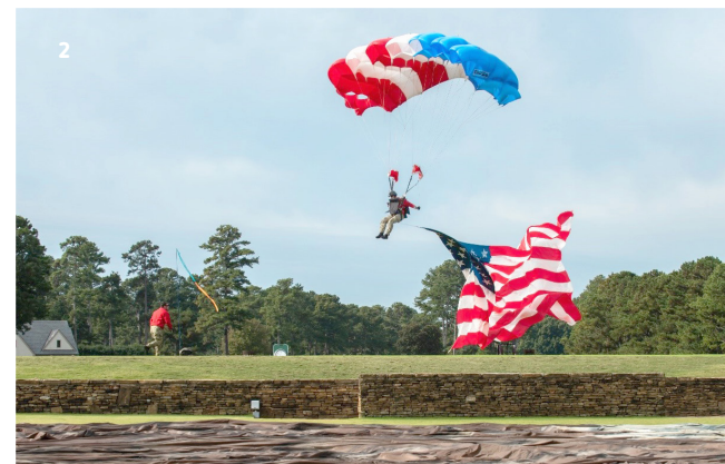
1. The Brookhaven Rotary Club raised a cumulative $1 million for the SHARE Military Initiative over nine years. 2. The golf tournament kicked off with a paratrooper jumping from an overhead plane.